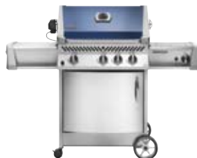
PT450RB in Blue Enamel with optional side burner