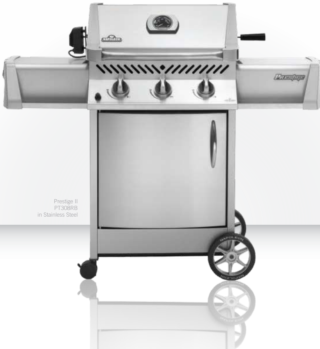
Prestige II PT308RB in Stainless Steel