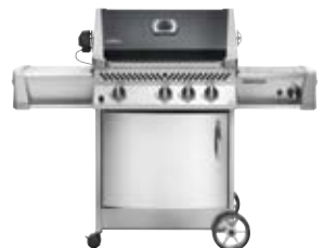
PT450RB in Black Enamel with optional side burner