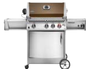
PT450RBI in Bronze Mist Enamel with optional side burner