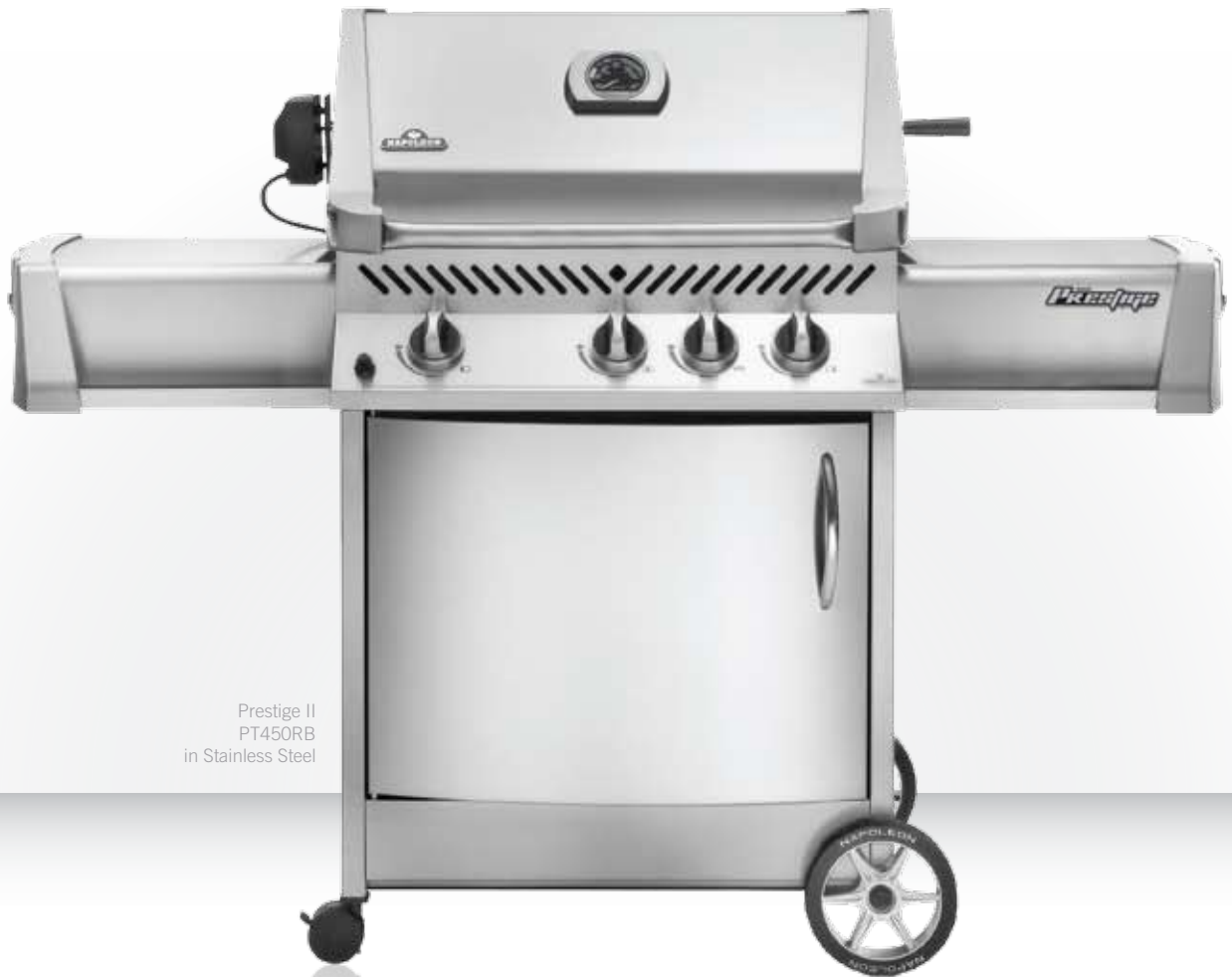
Prestige II PT450RB in Stainless Steel