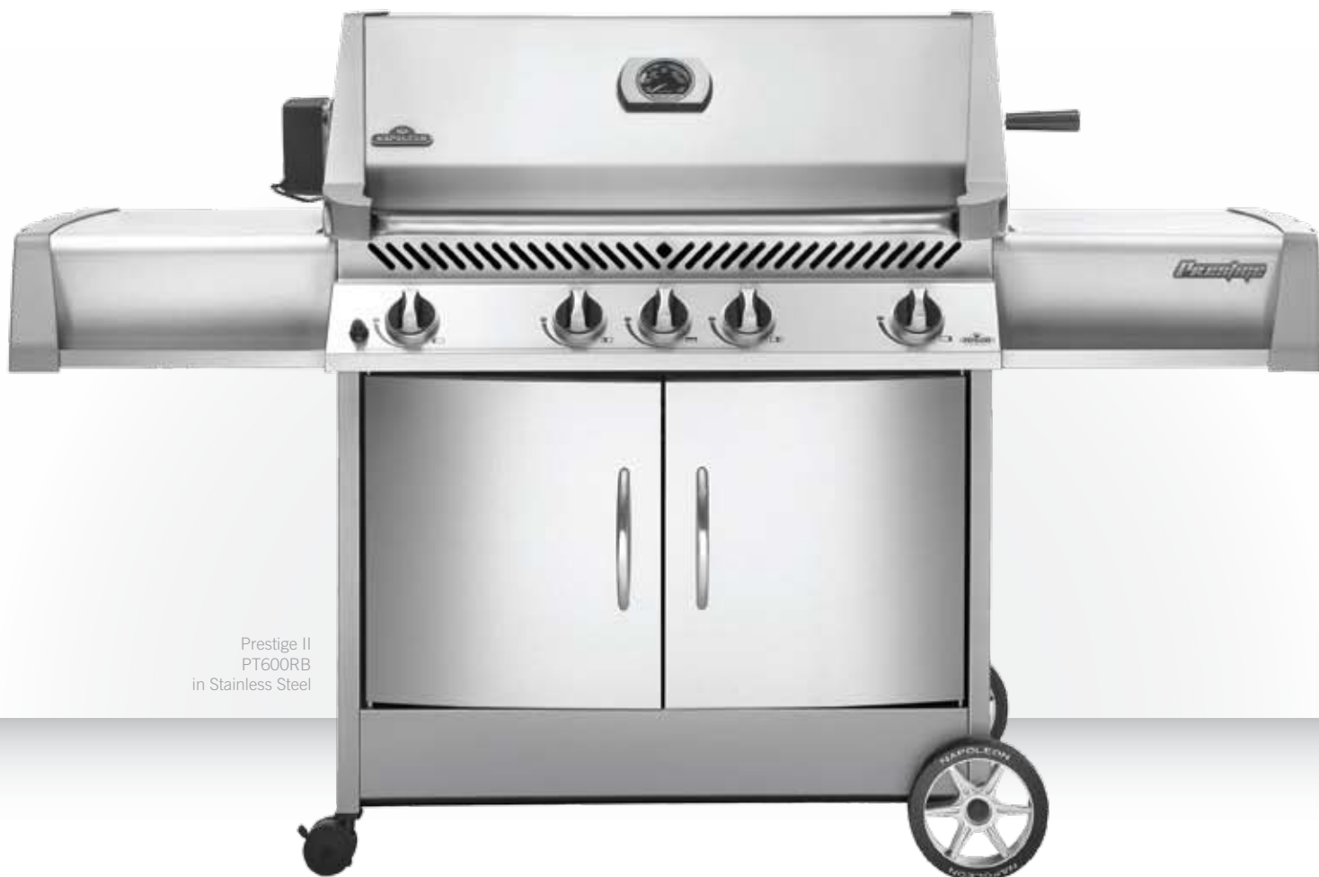
Prestige II PT600RB in Stainless Steel