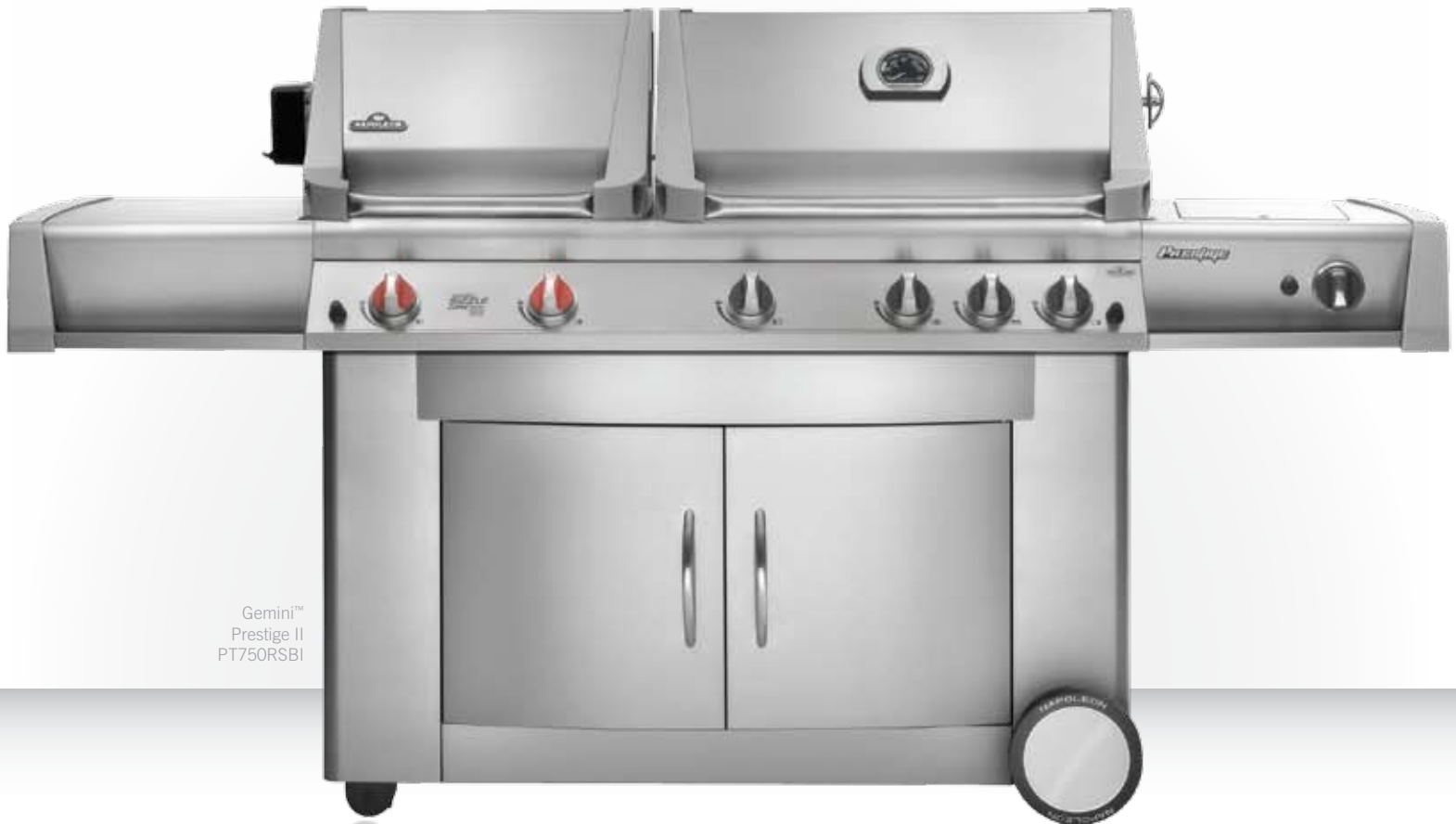
Gemini™ Prestige II PT750RSBI