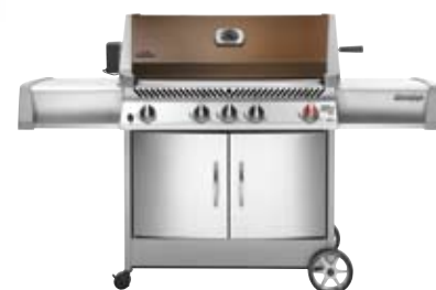
PT600RBI in Bronze Mist