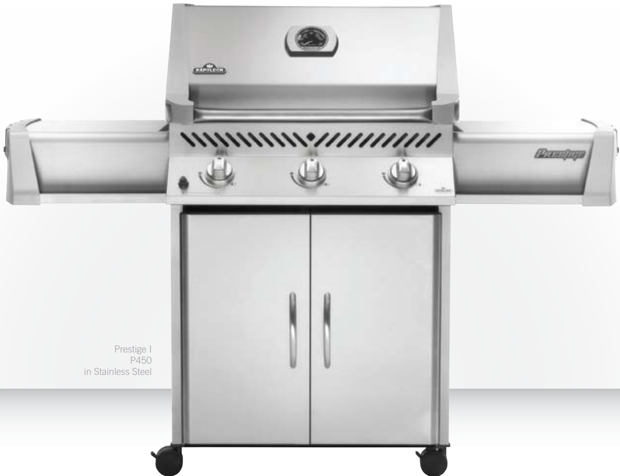
Prestige I P450 in Stainless Steel