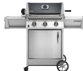
PT308RB in Black Enamel